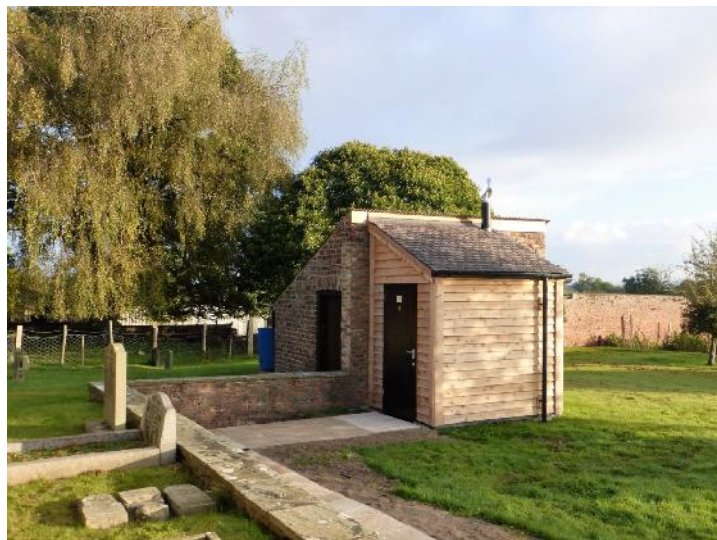
All Saints Church, Thirsk