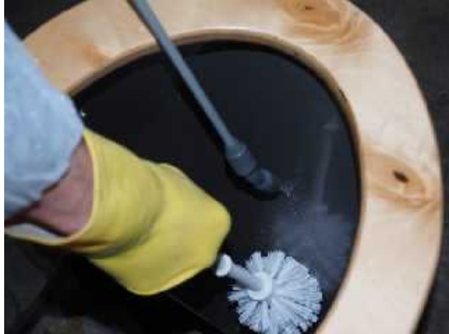
A pump sprayer is good but you could use a hand held spray bottle

Check that the soak bin is full. Wood shavings make good soak material but not sawdust. Chopped barley straw is a good soak material as it assists rapid decomposition but may be more difficult to use. (With barley straw manure worms could be introduced. They can usually be found in animal manure and rich garden compost heaps.)