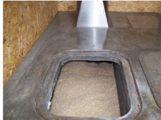
Use floor wax as supplied.