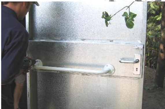
Grab rail on door