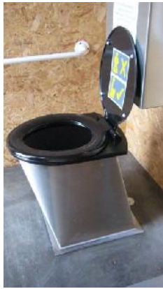
Use pedestal fix down (B4) at rear.