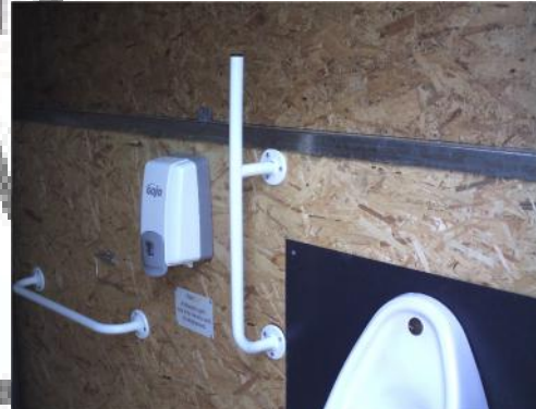
Urinal grab rail in metal buildings