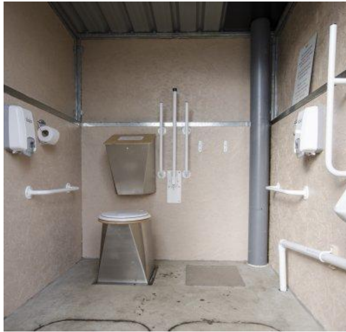
Metal building interior